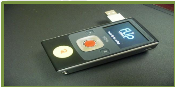
3. The back controls consist of the red record button, the play button, the delete button, and the 4 way controller.